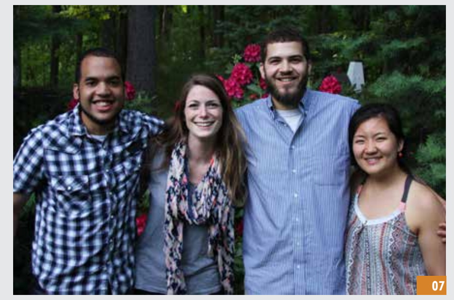
SEE WHAT'S GOING ON AT NATIVITY WORCESTER