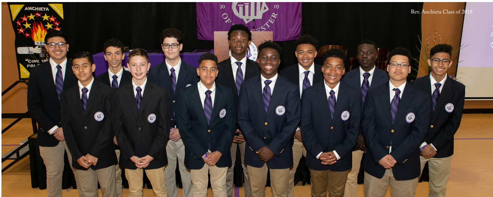
Rev. Anchieta Class of 2018

Member of the Association of Independent Schools in New England (AISNE)